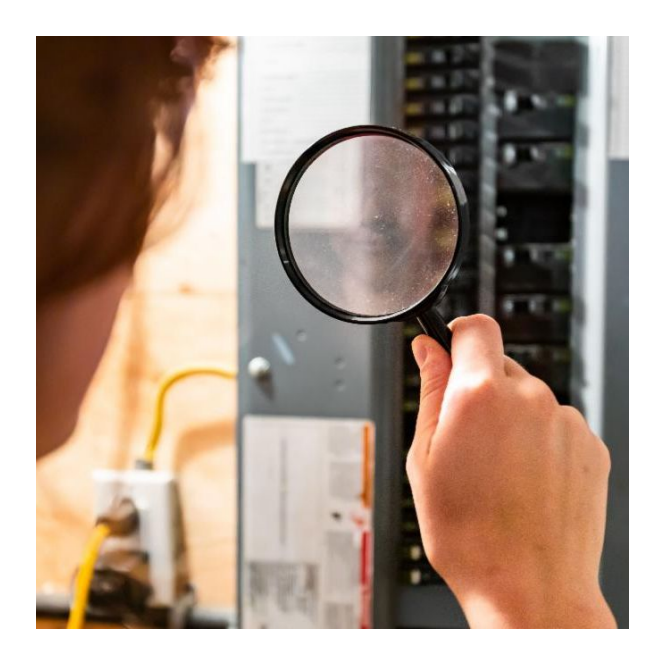
Please Note: Only ACI Members are eligible to earn the ASHI Electrical Inspector Digital Badge.